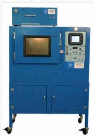
0500 with Catalytic Destruct Unit

The OREC™ Ozone Catalytic Destruct Units (CDUs) are designed for the OREC™ 0500 – 0900 series Ozone Chambers. The ozone that is discharged from the test chamber is “catalyzed” ... turning it back into oxygen, eliminating the need for complicated and costly external ducting. The CDUs are completely self-contained units which can be serviced separately from the chamber.